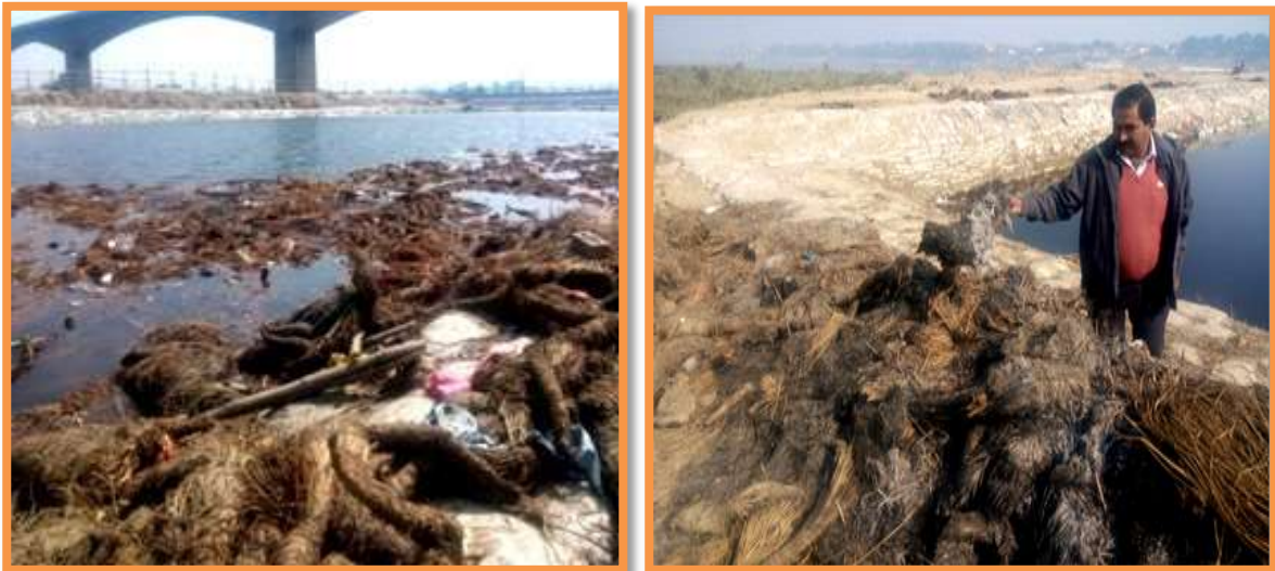
Figure 8: Semi-burnt idols skeletons removed from Ganga sarovar-I