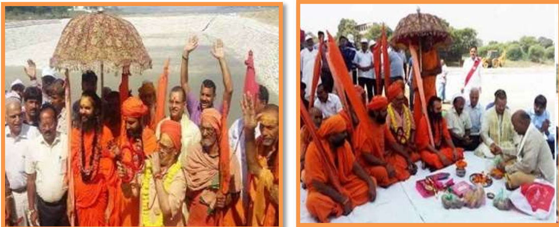
Figure 3: Observation of temporary Ganga Sarovar near Ganga river bank by Administrative authorities and Saints (sadhoo/sant)