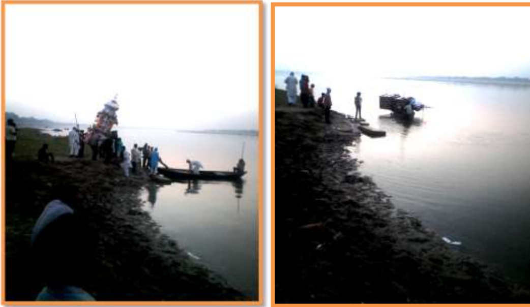
Figure 2: Tajiya immersed in holy Ganga river after Tajiya Festival