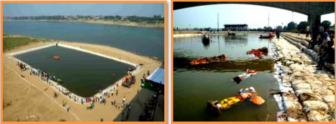
Figure 5: Idol immersed in Ganga Sarovar-I