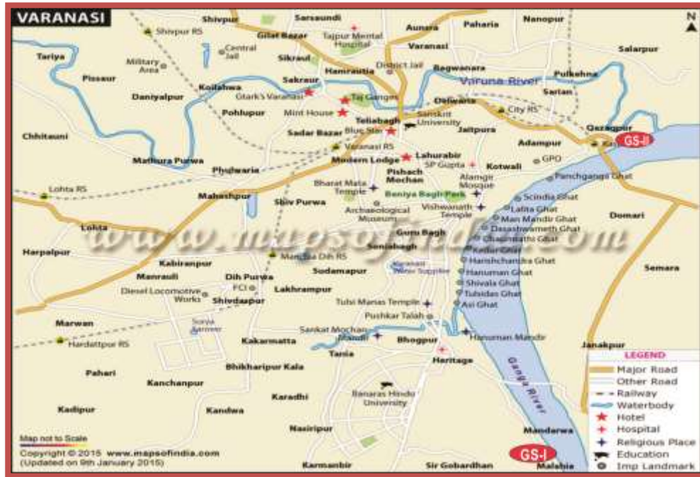
Figure 9: Site map. Ganga Sarovar-I (GS-I) and Ganga Sarovar-II (GS-II)