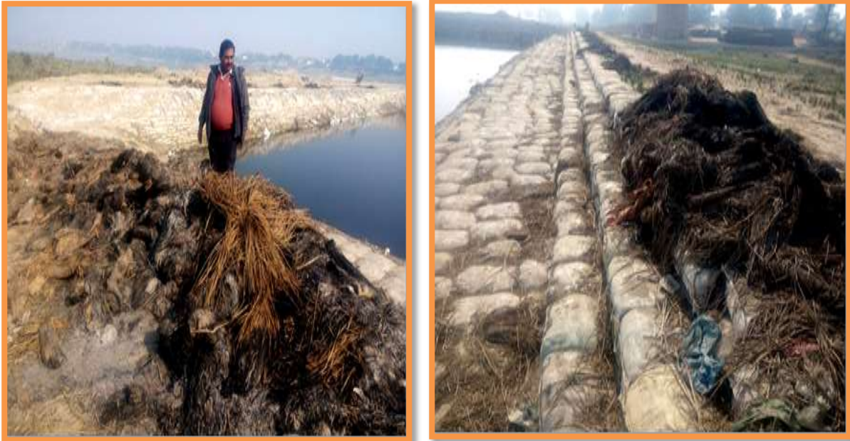
Figure 7: Semi-burnt idols skeletons removed from Ganga sarovar-I