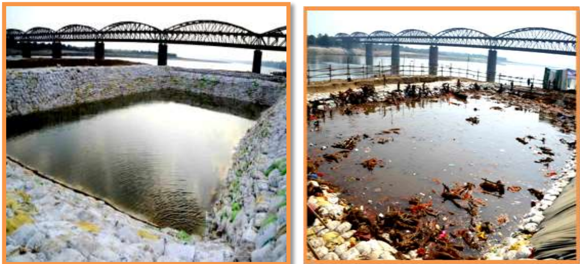
Figure 6: Idol immersed in Ganga Sarovar-II and idols material left in pond