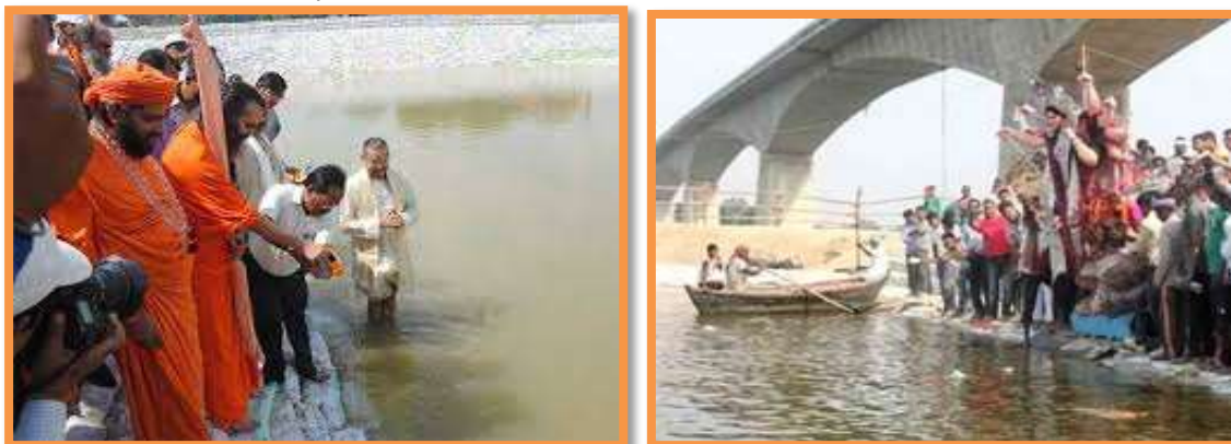
Figure 4: Performing Idol immersion in Ganga Sarovar after initiated rituals